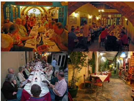
Dining out at a Taverna in Chania. At a another Taverna in Chania. Taverna in an alley opposite the Cathedral...... and further down the alley, with more romantic tables.