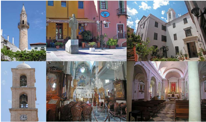
Ahmet Aga Minaret, in Hatzimichaly Daliani Street. (LEN) Ecumenical Patriarch Athenagoras, in Cathedral Square. (KEI) Catholic Church, outside, – accessed by alley - 46 Halidon Street. (HAR) Belfry – Cathedral, Greek Orthodox, Virgin of the three Martyrs. (HAR) Cathedral - Inside. (HAR) Catholic Church of the Assumption of the Virgin Mary, Inside. (HAR)