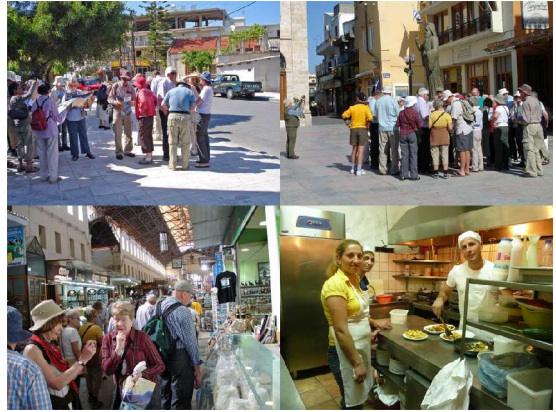
Group with their new maps outside Hotel. (LEN) Group in Cathedral (Greek Orthodox Church) Square. (LEN) Members in the Market. (LEN) Kitchen of a Taverna. (HAR)