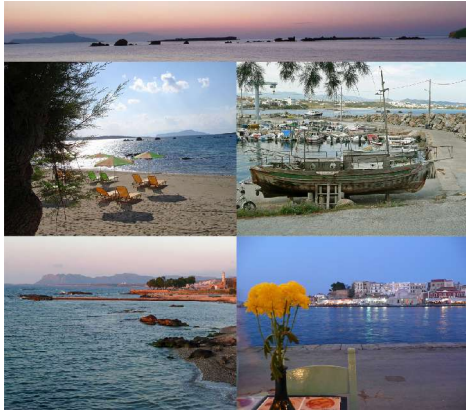
Sunset whilst dining at a Taverna. (HAR) Beach - Walking from the hotel to the Town. (LEN) Marina - Walking from the hotel to the Town. (HAR) Nearing the Town for dinner at Sunset. (HAR) View from another Taverna in the Harbour. (HAR)

Zoom in to about 300 or 400% to view pictures better (The 'dynamic' Zoom is a good tool to use)