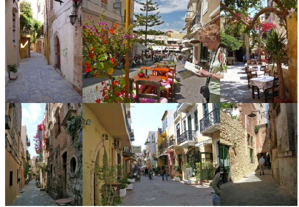
Just a few of the many Streets of Chania.