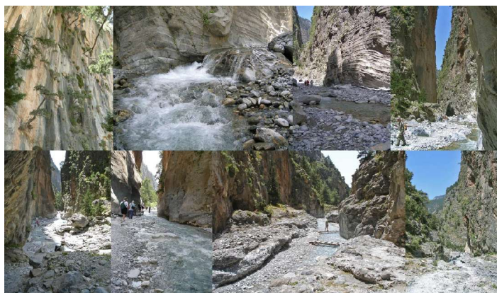
Largish trees on the cliff face. (HAR)... then, Tumbling Water. (KEI)x