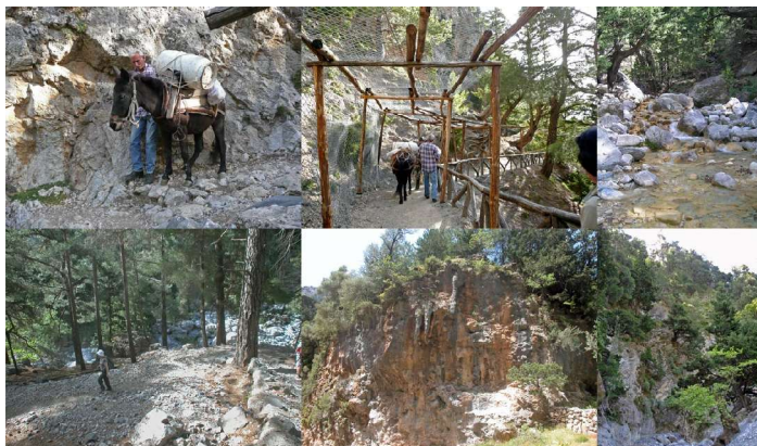
A working donkey. (HAR)