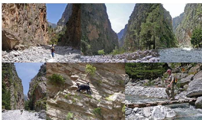
The Gorge has a dry river bed at this time of year.