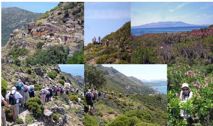
A real mountainous path. (LEN) Over the Hill. (LEN) Blooms. (LEN) Through the rocks. (HAR) The route far ahead. (HAR) Forcing the way through the bushes. (LEN)