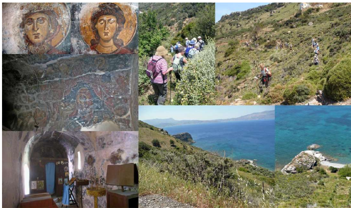
Left Top – The tiny Church of Agia Marina with 2 face Frescos. (x2 LEN) Left Centre – Ceiling Frescos; Left Lower - church Interior (x2 HAR) Going Down (actually, before we reached the church). (KEI) Getting a little Spread out (LEN) Drinks stop in sight – near the rock outcrop. (HAR) A picturesque rock in the sea of the image beside it. (HAR)