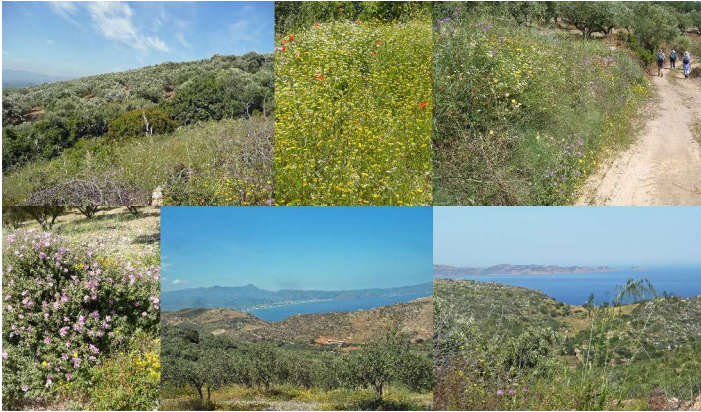
Olive Trees. (HAR) Flowers by the wayside. (HAR) Flowers, Olive trees and Ramblers. (KEI) More Flowers by the wayside. (HAR) Our first View of the Sea. (LEN) A Sea View a bit further up the Coast. (HAR)

Zoom in to about 300 or 400% to view pictures better (The 'dynamic' Zoom is a good tool to use)