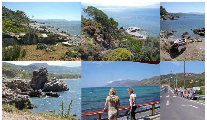
Down on the Beach now. Climbed higher again. Down now with the boats. Weather Sculptures in the Water. A Bar with a view. The Lone Bus Stop.